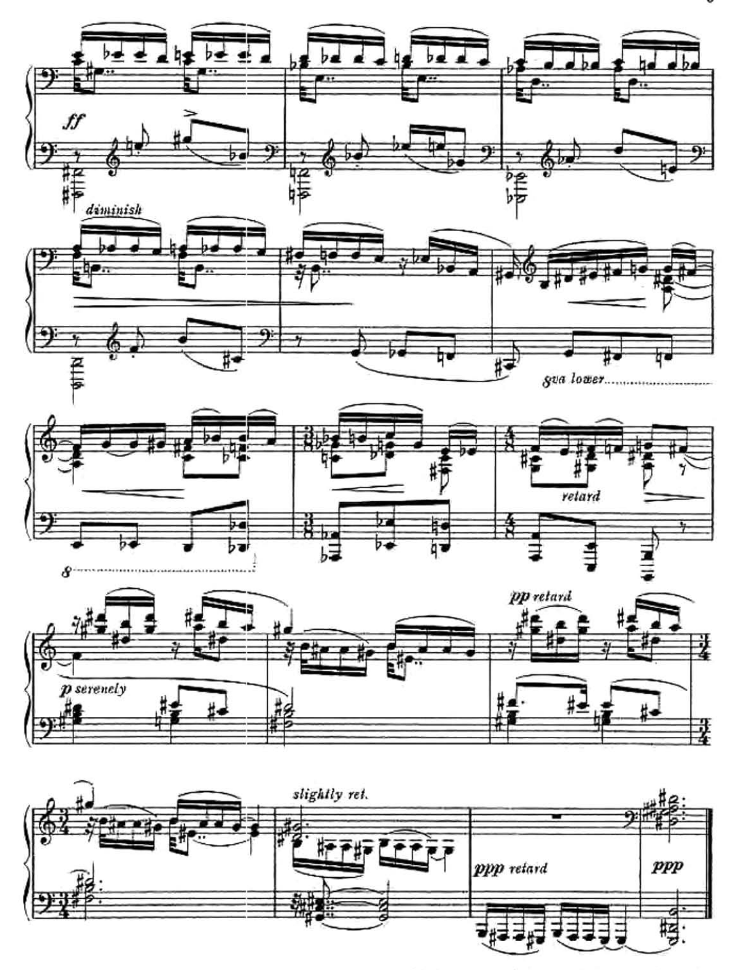
Printed in Bugland by Augener Ltd., Acton Lane, London, W. 4