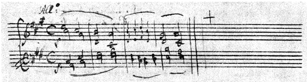
Eintrag Mozarts betr. das Klarinettenquintett in A KV 581 aus Verzeichniß aller meiner Werke Vom Monath Februario 1784 bis Monath . . . 1 . . . Blatt 22 v /23 r nach dem im Besitz von Frau Eva Alberman, London, befindlichen Autograph.

in 29 a detto. Quintetto à i clarinetto, 2 Violini, Viola e violoncello