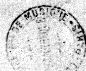
Erste Seite zum Bruchstück eines Klarinettenquintetts in B KV Anh. 91 (516c) nach dem Autograph im Besitz der Bibliothek des Conservatoire de Musique, Paris (Ms. 262); vgl. S. 41, T. 1-28.