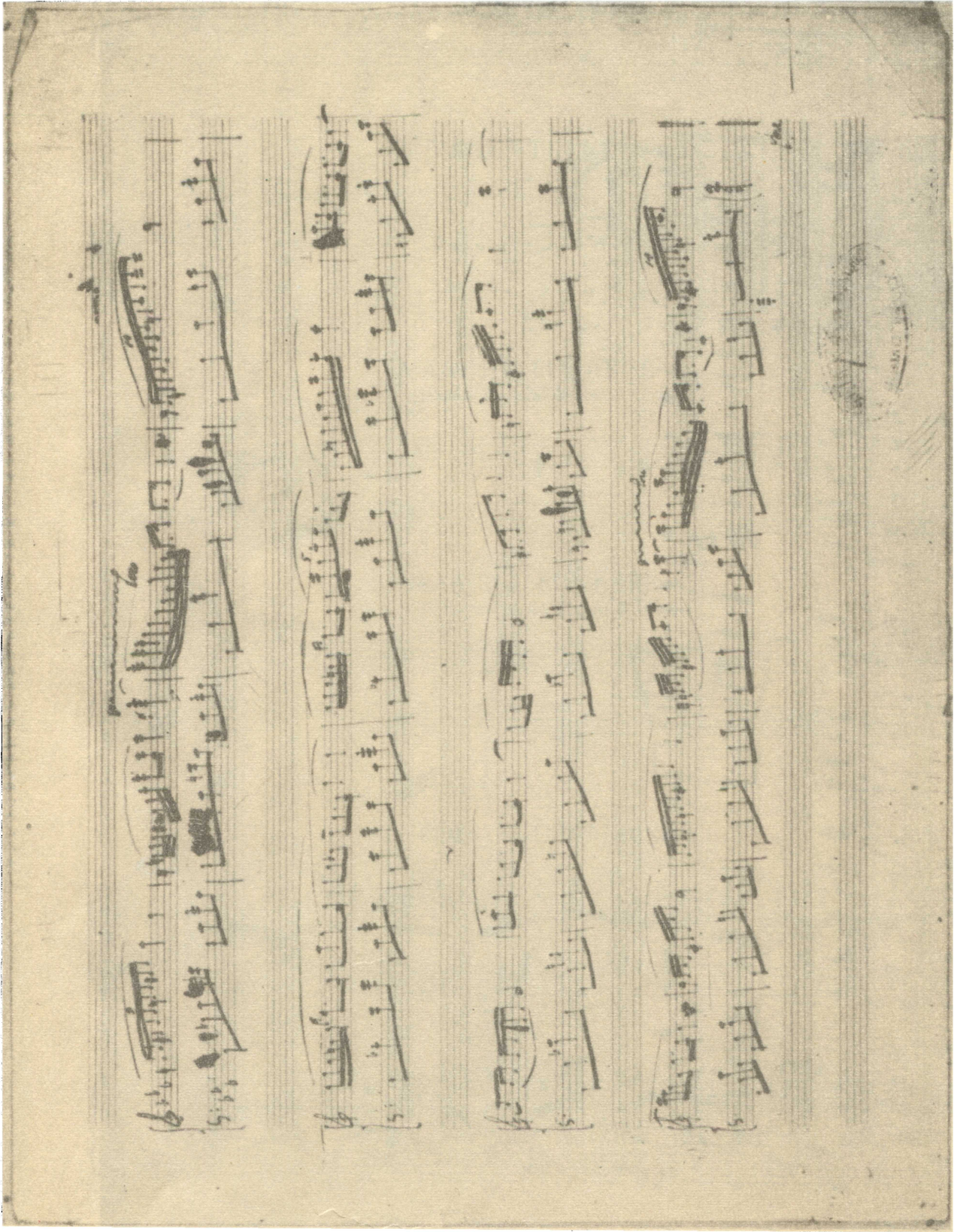
AUTOGRAPH OF THE NOCTURNE IN C MINOR (SECOND PAGE)